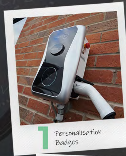
1 Personalisation Badges

We have three types of branding you can choose from, these are: 1. Personalisation Badges , 2. Logo Covering Badges , or 3. Sticker Decal Transfers .