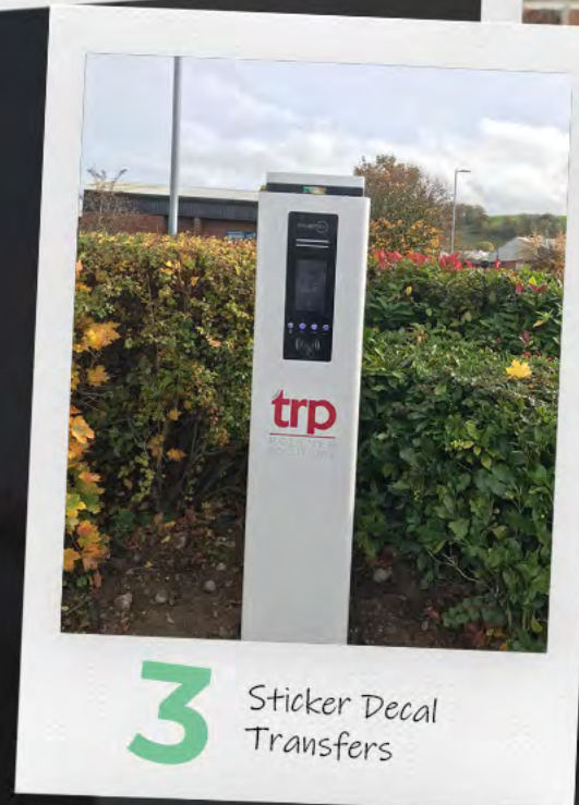
3 Sticker Decal Transfers