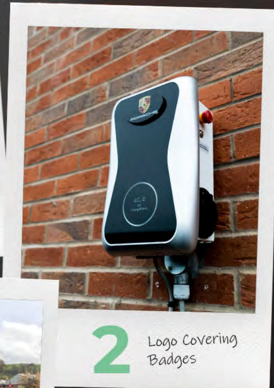
2 Logo Covering Badges