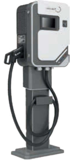
Optional Floor Stand (Not Included)